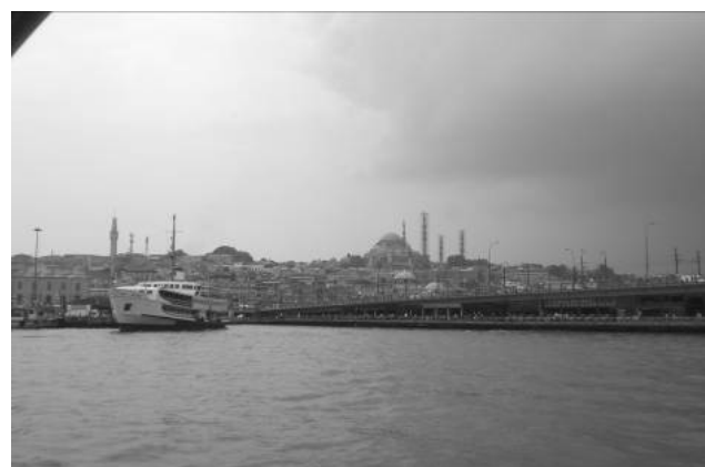
Figure 1 (left): View of Suleymaniye Camii from Eminonu; (on 7 th of June 2008)